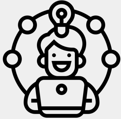
For Awards in Scholarly Work